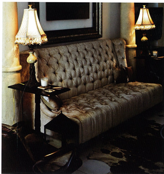
DECADENT LIVING: AFRICAN ART IS PAIRED WITH ROMANESQUE STRUCTURES AND SET AGAINST CONTEMPORARY FURNITURE TO ACHIEVE A LOOK THAT IS UNIQUE AND FULL OF CHARACTER